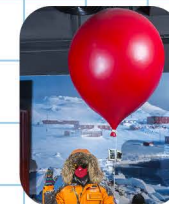
releasing weather balloons