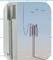
sea floor drilling with gravity corer