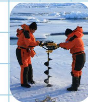
ice core drilling